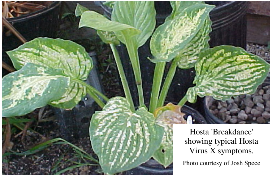
Hosta 'Breakdance' showing typical Hosta Virus X symptoms.

Hosta Virus X affects different hosta cultivars in different ways, so it is impossible to give a definitive description of symptoms. The most common visual symptom is blue or green markings on a light colored leaf. These markings usually follow the leaf veins and bleed out into surrounding tissue giving the plant a mottled appearance. The tissue often appears lumpy, puckered, and of different thickness or texture than normally colored tissue. Less common symptoms include dried, brown spots and twisted, deformed leaves. It may be difficult to detect off colored mottling on dark, solid colored leaves. Some green tissue will show lighter colored mottling along the veins, but it is not as pronounced as the markings on gold tissue. To make matters worse, some hosta cultivars don't seem to show any visible symptoms of being infected with HVX and it may take 2 to 4 years for symptoms to show after a plant has been infected.